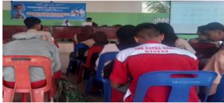
Figure 5. The Practicing Canva Application