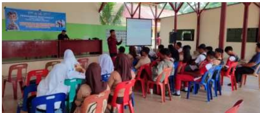
Figure 4. The Tutor explained about Canva Application

The PkM team then explained to the participants that the canva application is a platform in the form of an application and web to create designs. The designs that can be made are numerous and varied. In the Canva application, you can create presentation materials that are more interesting and visually visible. Media is a tool used by teachers and students to design materials and improve the quality of learning, one of which is design through PPT in the canva application (Irsan et al., 2021). This means that the use and use of Canva as a learning medium can help and make it easier for learners to design learning materials with individual creativity. In the Canva application, there are many free templates that can be created into easy and interesting teaching materials for students (Wijaya et al., 2022). The use of canva in the teaching and learning process can attract students in the teaching and learning process (Rusdiana et al., 2021). The purpose of the discussion above is to increase the knowledge and understanding of students about the advantages of the Canva application as a tool in designing learning materials and making learning content interesting, creative and easy for students to understand.