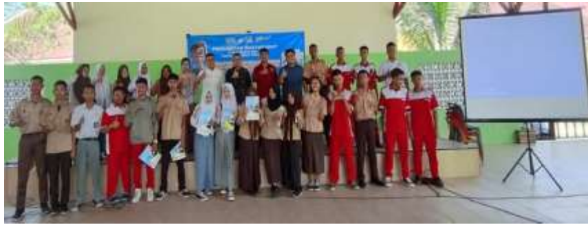
Figure 2. The team PkM and some participants