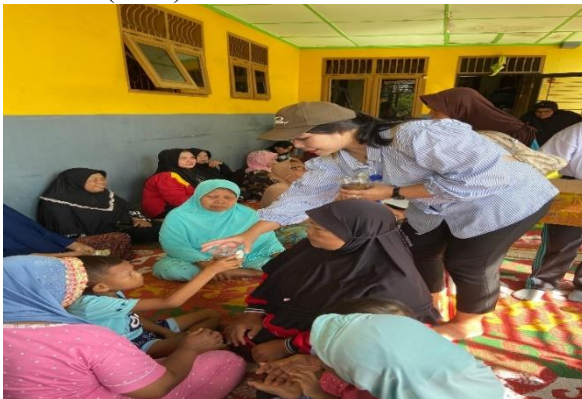
Figure 2. distribution of PMT

Community service activities regarding the provision of additional food for the elderly at the Sukaraya Village Health Post, Pancur Batu District, Deli Serdang Regency, have been carried out well and involved 50 elderly people. A total of 50 seniors, aged 60–85, participated in this activity. The majority of participants (60%) were aged 60–70, and the majority were women (68%).