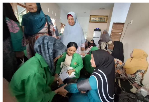
Figure 3. Blood pressure check