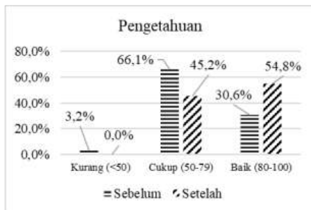
Figure 3. Knowledge Before and After Intervention

The results of the study showed that knowledge in the samples before the nutritional education intervention (Pretest) showed that the most were 41 samples who had sufficient knowledge with a percentage of 66.1%, while the least were two samples who had insufficient knowledge with a percentage of 3.2%. Knowledge in the samples after the nutritional education intervention (Posttest) increased where the most were 34 samples who had good knowledge with a percentage of 54.8%, and the rest, namely 28 samples, had sufficient knowledge with a percentage of 45.2%.